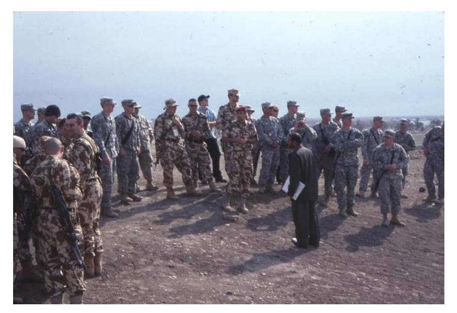
Coalition troops visiting the site of Ur.

The site of Ur is just to the north of the vast Tallil Airbase, now used by the coalition forces, that contains two runways and is one of the largest military airbases in the Middle East. The Airbase itself is rectangular in shape, measuring c .5.9 km x 4.8 km, i.e. about 2832 has. (by comparison, the camp at Babylon covers an area of about 150 has.). The Front Gate complex (the Visitor Control Centre, or VCC), measuring about 400 m square, is situated some 2.7 km to the north of the Airbase, so that Ur is between the Airbase and the Front Gate and is included within the perimeter fence that goes from the Front Gate around the entire Airbase. This means, in effect, that the site of Ur is accessible to troops on the Airbase but not to Iraqi civilians who may wish to visit the site. Coalition troops do in fact